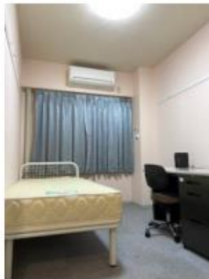
[Shared space (Share with two roommates)]

Cookware shelf, shoebox, and refrigerator