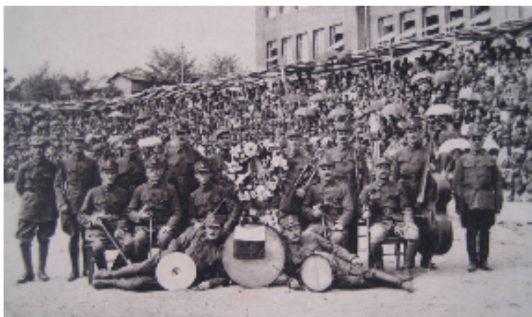
Athletic Meeting at Kwansei Gakuin, 1919.

Shingetsu-kai, http://www.kg-gee.gr.jp/index.pl/ob/ (in Japanese) Kwansei Gakuin Archives, http://www.kwansei.ac.jp/gakuinshi/ARCHIVESEhtm Nishinomiya 662-8501 JAPAN